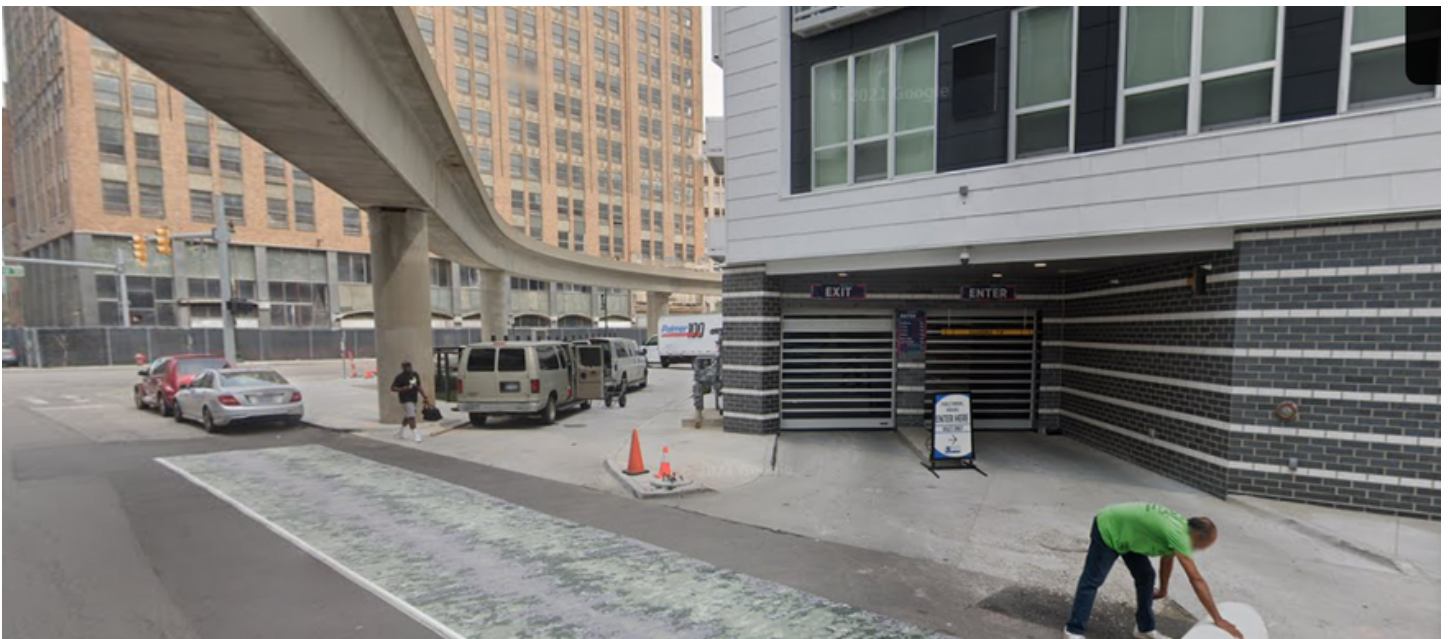
The Garage entrance off of Clifford St